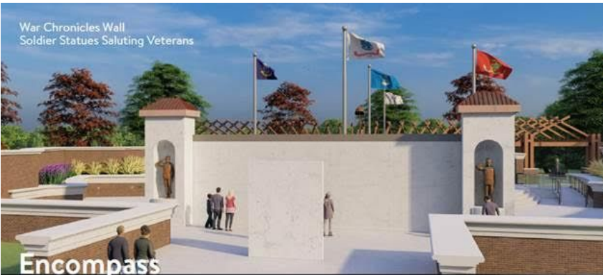
War Chronicles Wall Soldier Statues Saluting Veterans