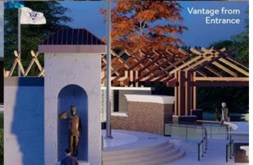
Vantage from Entrance