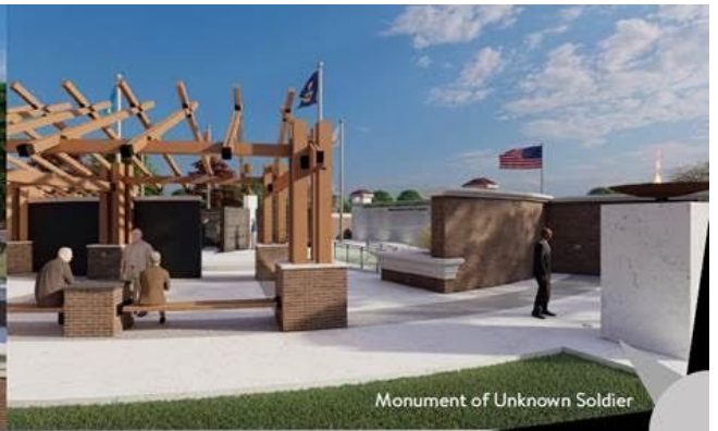
Monument of Unknown Soldier