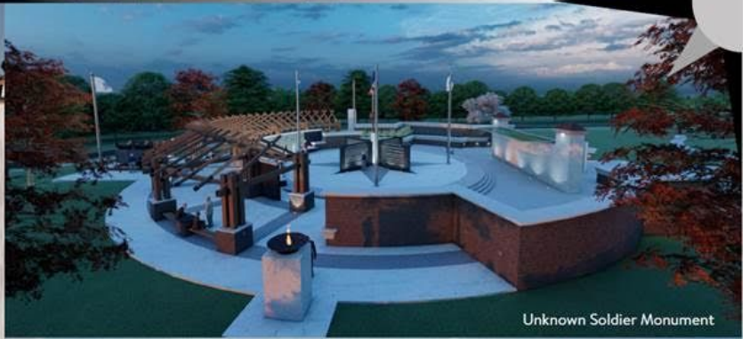
Unknown Soldier Monument