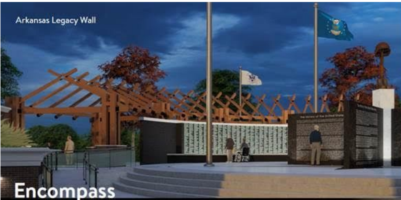
Arkansas Legacy Wall