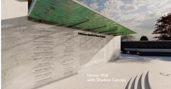
Honor Wall with Shadow Canopy