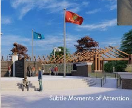
Subtle Moments of Attention