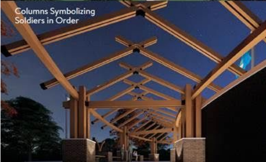
Columns Symbolizing Soldiers in Order