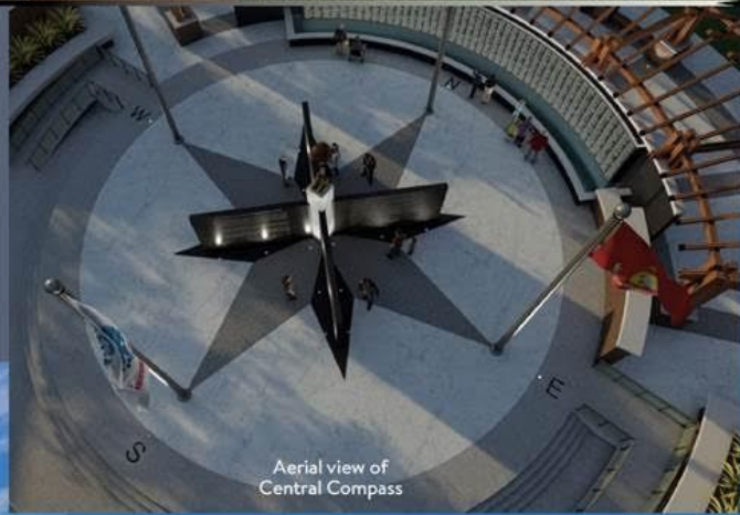
Aerial view of Central Compass