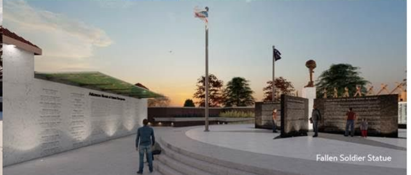
Fallen Soldier Statue