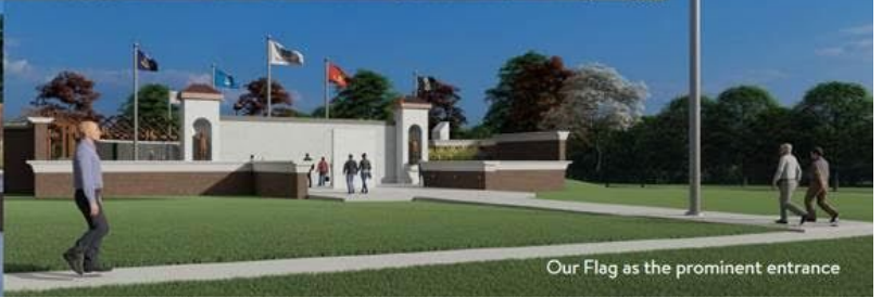
Our Flag as the prominent entrance