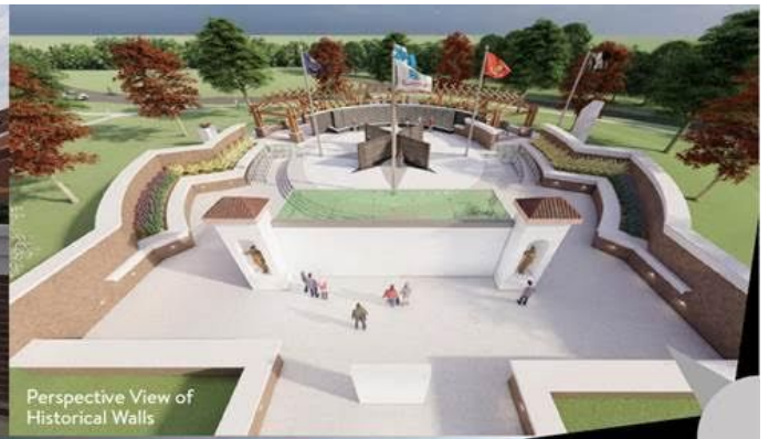
Perspective View of Historical Walls

Don Tyson Memorial Park, Springdale AR USA