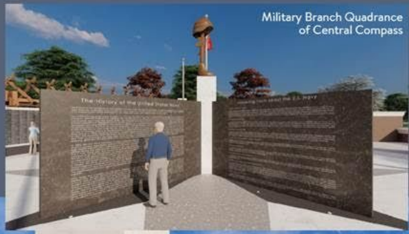
Military Branch Quadrance of Central Compass