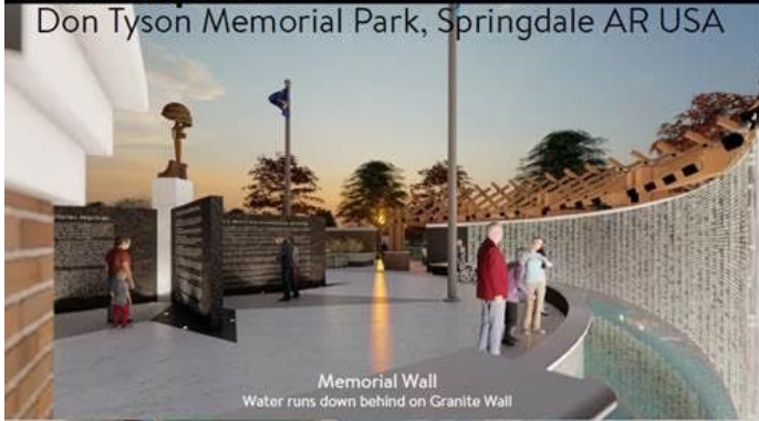
Memorial Wall Water runs down behind on Granite Wall