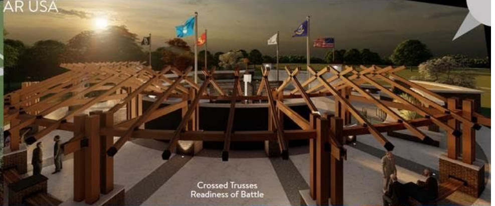
Crossed Trusses Readiness of Battle